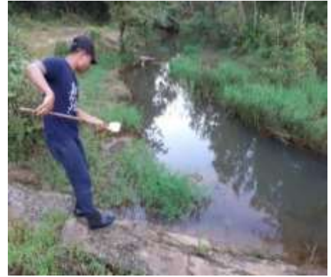
Larval collection from field