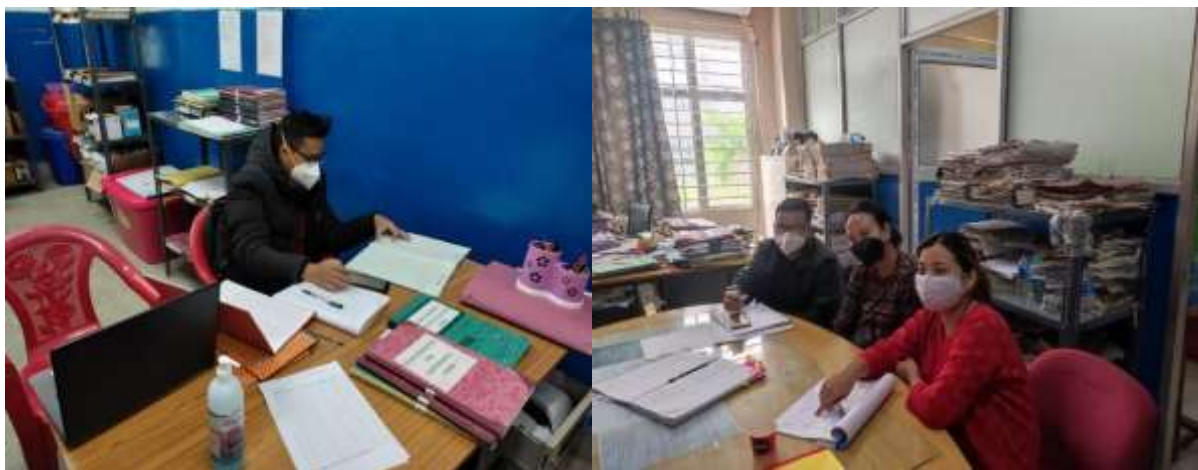
Research assistance compiling and analysis data at Imphal, Manipur