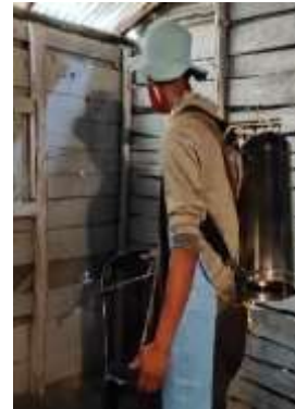
Observation of IRS preparation, spraying and wall marking