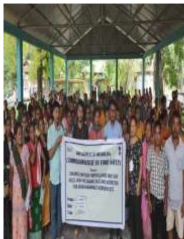
Chokpot Block, South Garo Hills