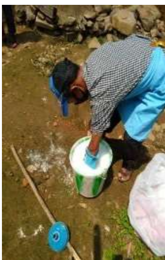
Figs. Indoor residual spraying related activities