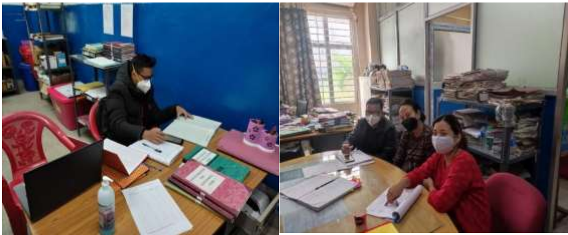
Research assistance compiling and analysis data at Imphal, Manipur

2.1.3. Thiamine deficiency and cost effectiveness analysis of thiamine