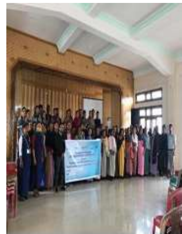
Saipung Block, East Jaintia Hills